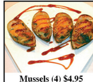
Mussels (4) $4.95