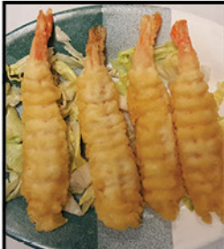
Shrimp Tempura (4) $4.25