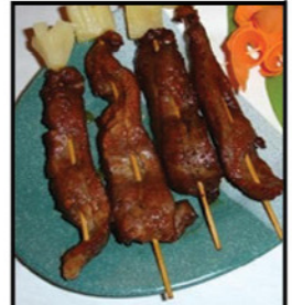
Skewered Beef (4) $4.95