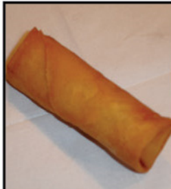
Shrimp Spring Roll $1.15 Pork Spring Roll $1.15