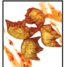
Fried Crab Rangoon (4) $3.25