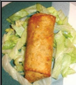
Chicken Egg Roll $0.99 Vegetable Egg Roll $0.89