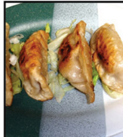
Chicken Dumplings (4) $3.95