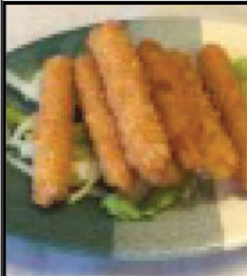
Fried Calamari (7) $4.25