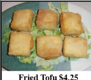
Fried Tofu $4.25