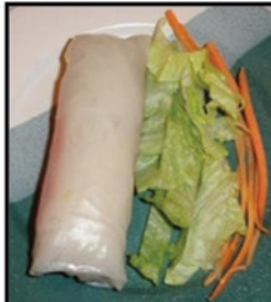
Steamed Chicken Roll $1.15