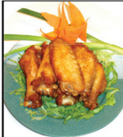
Chicken Wings (4) $4.50