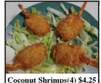
Coconut Shrimps(4) $4.25