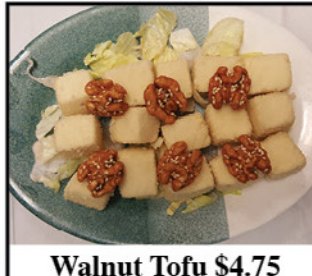
Walnut Tofu $4.75